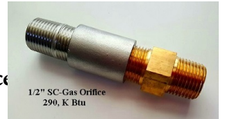
Brass Gas Orifice

Wiring when 2 Fire Features Turned On & Off with One Button (PS-30V320 Transformer) One Fire Feature uses a (PS-30V185 Transformer)