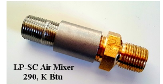
Propane Gas Air Mixer